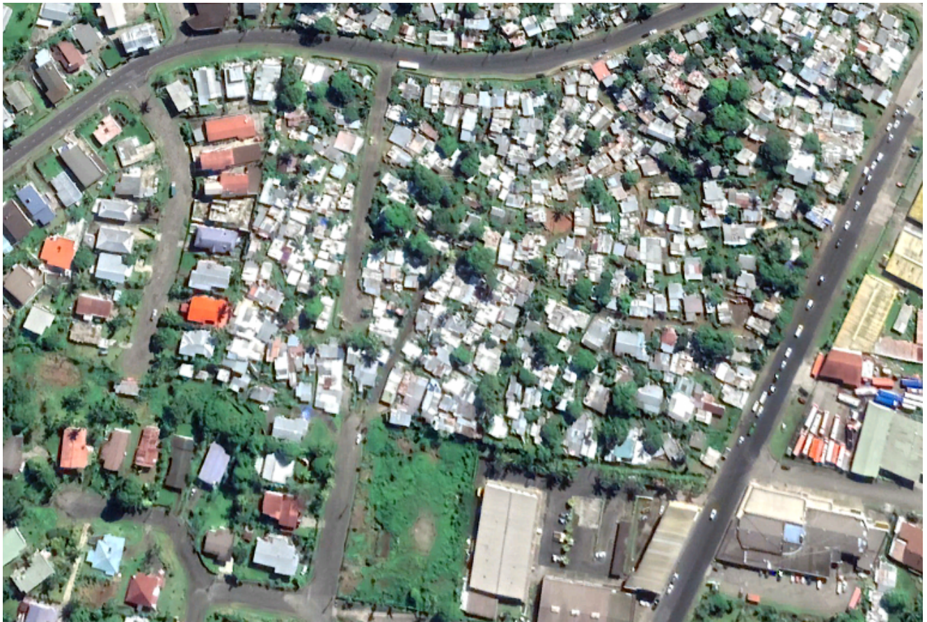
Urban space in Suva