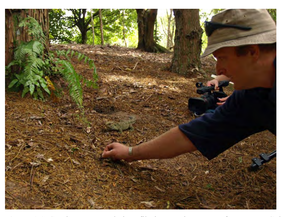
Figure 1.1) Staging weta predation; filming captive tuatara for Love in Cold Blood at Nga Manu Reserve, Waikanae. (Photo by Jane Adcroft).

This conclusion was also confirmed during our own filming for Love in Cold Blood , as the methodology we followed was also more fitting to a film rather than to the documentary genre. In early 2009 we traveled to Nga Manu Reserve in Waikanae, New Zealand, to film captive tuatara, having already storyboarded and scripted the narrative we wanted. Throughout the filming period we waited for long periods to film the _natural behaviour we had scripted. Time constraints meant that we did create some behaviour-placing the captive tuatara where we wanted them in shot (Figure 1.1), or deliberately feeding them insects to obtain predation sequences. Carla and I did not consider this invasive or unethical- the captive tuatara were normally fed live insects and were often available for public interaction and handling. However, as Bousé (1998) suggests, it does cause complications when defining our film as documentary. Natural behaviour was contextualised as re-enactments. Therefore I believe our film, along with other so-called documentaries, should be re-defined as a _wildlife drama', whereby anthropomorphism can be considered a legitimate and necessary characterisation technique.