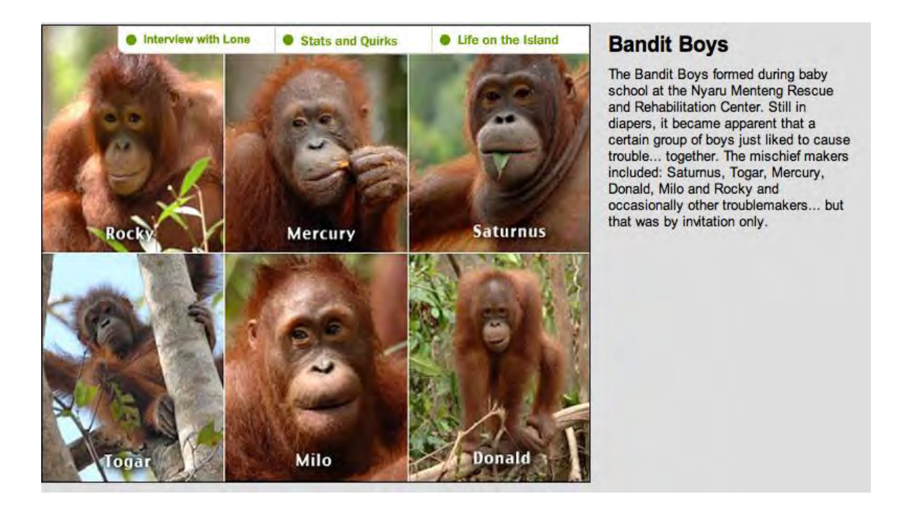
Figure 5.1) Image taken from the Animal Planet's Orangutan Island website showing the named members of the 'Bandit Boys', a group of orphaned orangutans (http://animal.discovery.com/tv/orangutan-island/meet/bandit-boys.html)

Animal Planet had a ratings hit with the 2007-2008 docu-soap series Orangutan Island . The series copied the winning formula of Meerkat Manor , with named characters, melodramatic situations and emotive narration and soundtrack. The two seasons follow several orphaned baby orangutans learning to survive as a group or society in a protected area of Borneo rainforest known as Orangutan Island. They attend rehabilitation classes in preparation for release back into the wild. Individual orangutan personality traits are emphasised and social groups are given gang names (Figure 5.2).