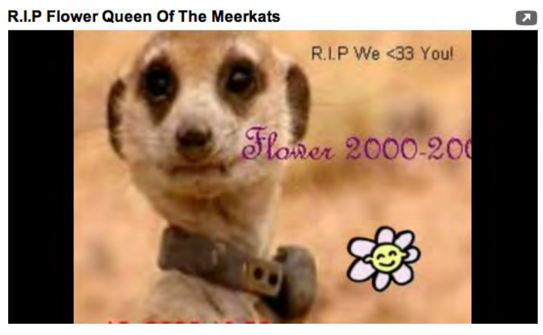
Figure 4.2) Screen grab from a eulogy tribute video for Flower the Meerkat, as posted on Youtube website (http://www.youtube.com/watch?v=UD Y-GAIa1I&feature=related)

Gallagher (2007), in the New York Times Magazine, criticises Meerkat Manor , saying: