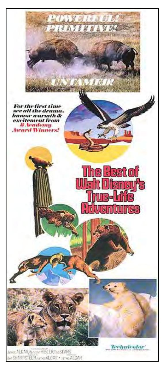
Figure 3.1) Poster advertising the eight-time Academy Award Winning True-Life Adventure series as The Best of Walt Disney's True-Life Adventures (Poster from www.movieposter.com).

Walt Disney became the first to produce nature dramas for commercial release. Prior to the hugely successful True-Life Adventure films, nature and animals had been seen as something to collect, capture and control (King 1996). Disney re-styled the humanisation of nature into the _Disney formula'; he bestowed personalities and story lines on individual animals, encouraging previously unexplored concepts of an animal's individual status and rights.