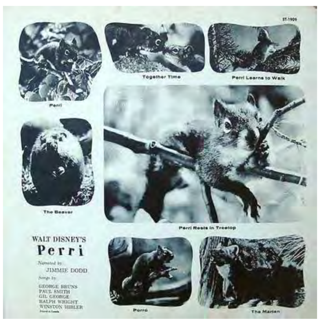
Figure 3.2) Record sleeve art for the musical soundtrack to Walt Disney's feature film Perri showing photographs of various animals with character descriptions.

Audiences were able to see themselves in the struggles of Perri , or the sweet, tough little ground squirrels in The Living Desert . Nature, previously something distant or _ollectable', became a familiar set of characters with identifiable belief and value systems – the audiences own (King 1996, MacDonald 2006). Audiences, particularly in post-war 1950's America, looked to the natural world to reaffirm their family values, gender roles, and distinguish between moral and amoral behaviour. They found validation in Disney's True-Life animal stars and their stories (King 1996, Mitman 1999, MacDonald 2006). Indeed, King (1996) argues that it was the very subjectivity of the True-Life Adventure films that gave them such powerful cultural leverage.