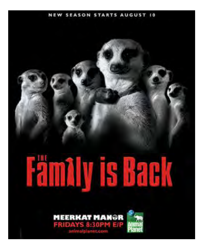
Figure 4.1) Poster advertising the season return of Meerkat Manor to the syndicated cable television channel, Animal Planet (from Entertainment Weekly Magazine, August 10<sup>th</sup> 2007)

Anthropomorphic techniques are often criticised for _sanitising' nature and perpetuating _safe' cultural expectations, a trend particularly evident in the critisicm of Disney's True-Life Adventures. Meerkat Manor , however, did not follow the _sanitised', _happyending' formula. Humanised meerkat _dharacters' suffered the full effect of _unsanitised' nature, causing intense pain and grief for Meerkat 's audience. The outcome, however, was essentially the same, with both forms of representation encouraging viewer emotional investment.