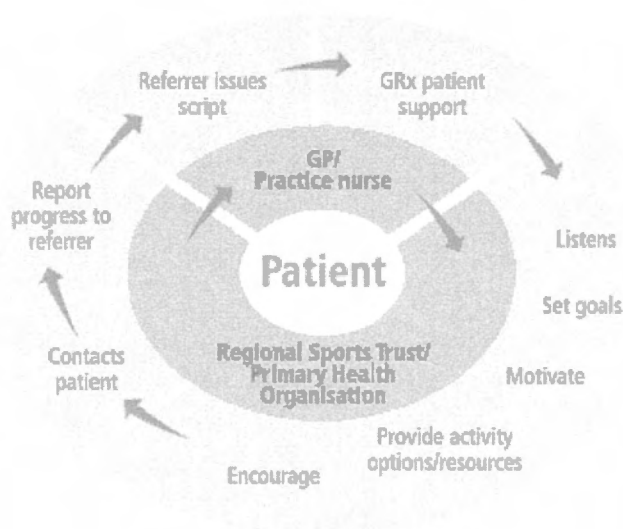
Figure 1.1: The Green Prescription Programme: How it Works

GRx support is provided for a period of three to twelve months, or until participants are confident that they can remain active independent of the programmes support. Although the programme is primarily concerned with increasing the level of physical activity, behaviours relating to bad nutrition and smoking are frequently addressed, depending on the individual in question.