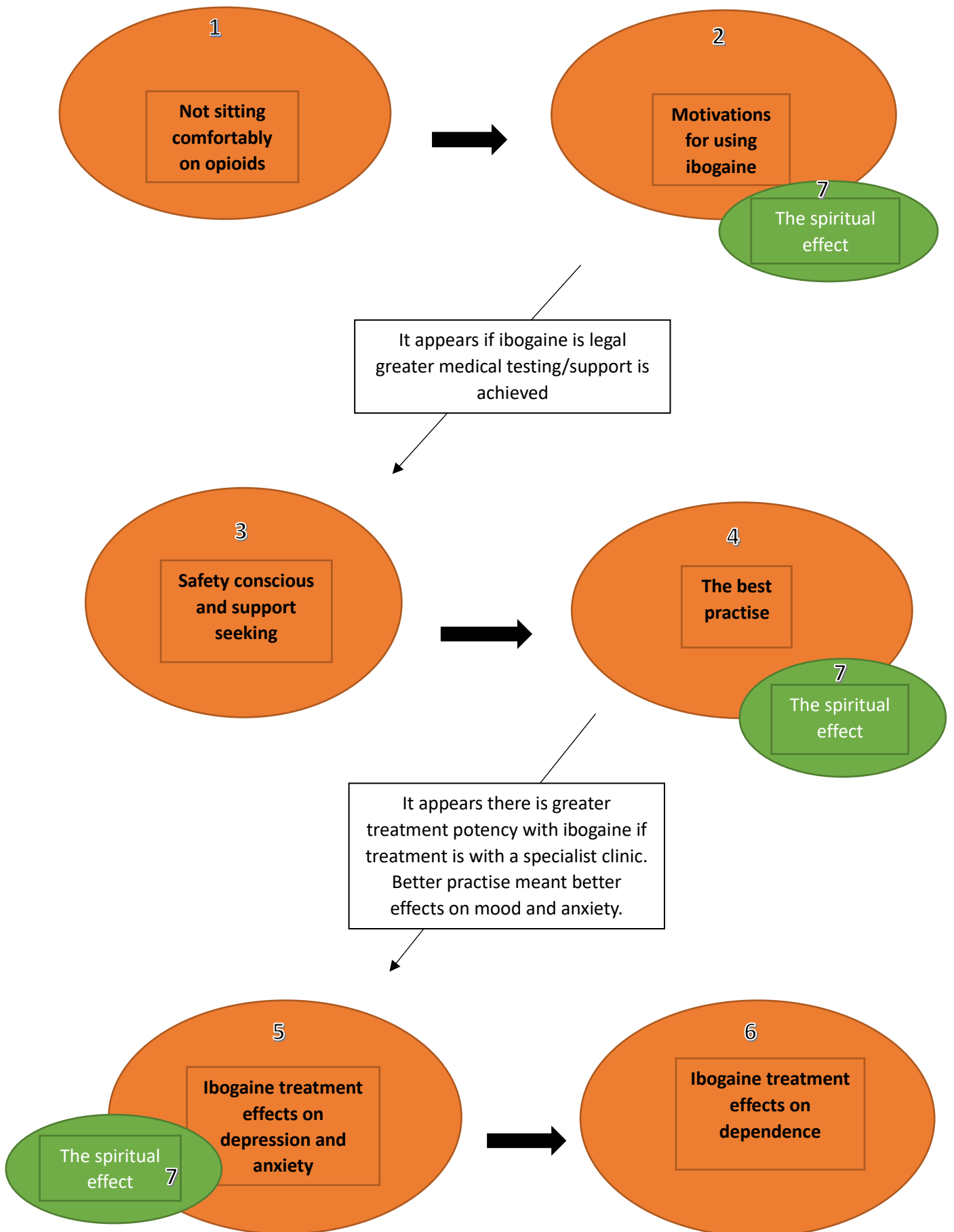
Diagram 1: Theme Diagram